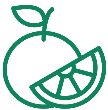
Cirtus Waste Processing

Using the waste from the production of orange juice to recover EO and then produce by-products such as animal feed, high quality molasses for food industry, and d-Limonene for cosmetic industry.