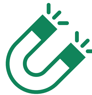
WEEE for Magnets

Using CFRP waste from the production of new composite materials to be re-used in the production of drones in the value chain